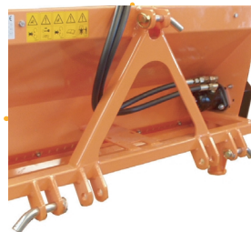
3-point hitch cat. 0-1