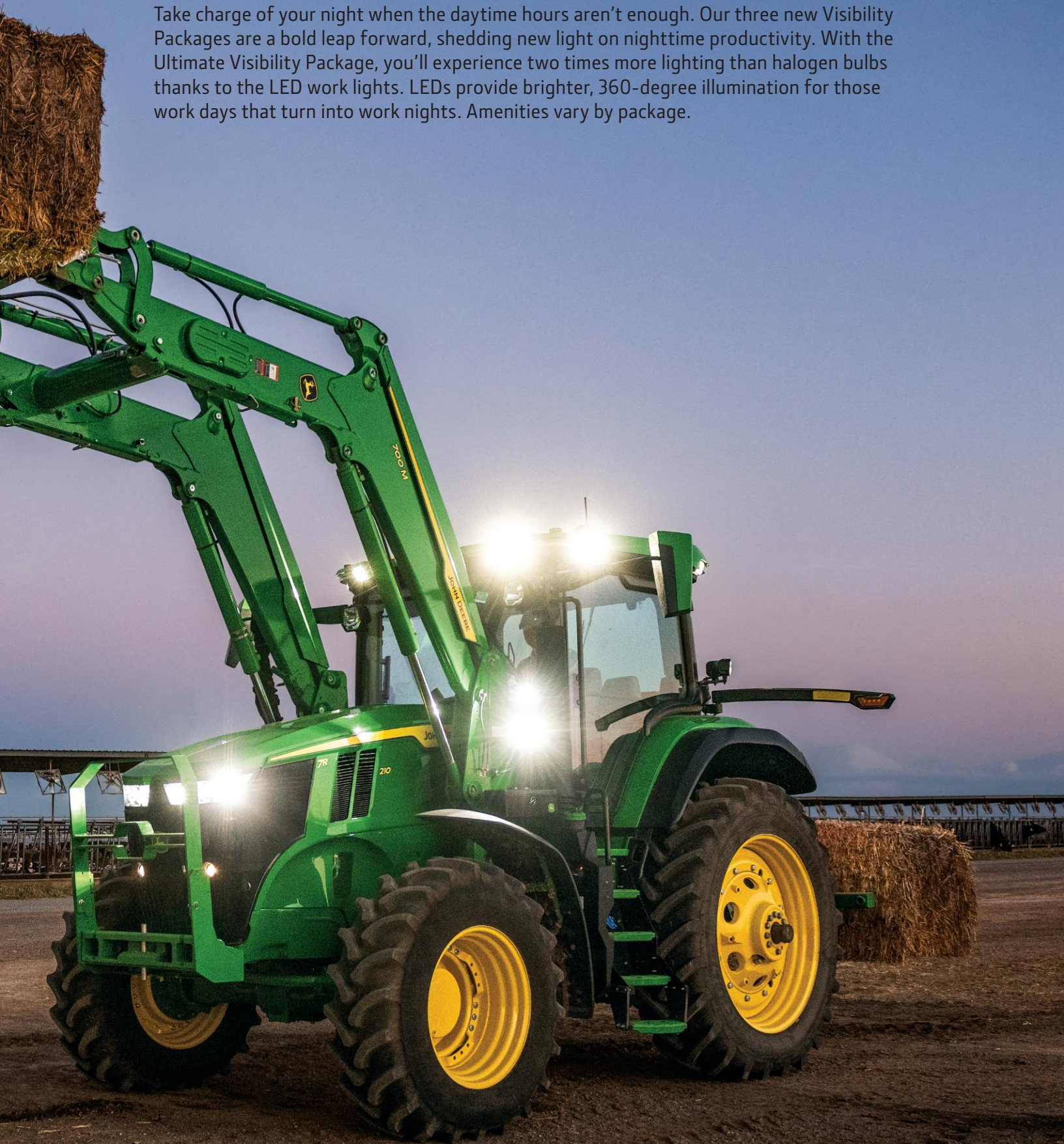
Ultimate Visibility package shown.

Take charge of your night when the daytime hours aren't enough. Our three new Visibility Packages are a bold leap forward, shedding new light on nighttime productivity. With the Ultimate Visibility Package, you'll experience two times more lighting than halogen bulbs thanks to the LED work lights. LEDs provide brighter, 360-degree illumination for those work days that turn into work nights. Amenities vary by package.