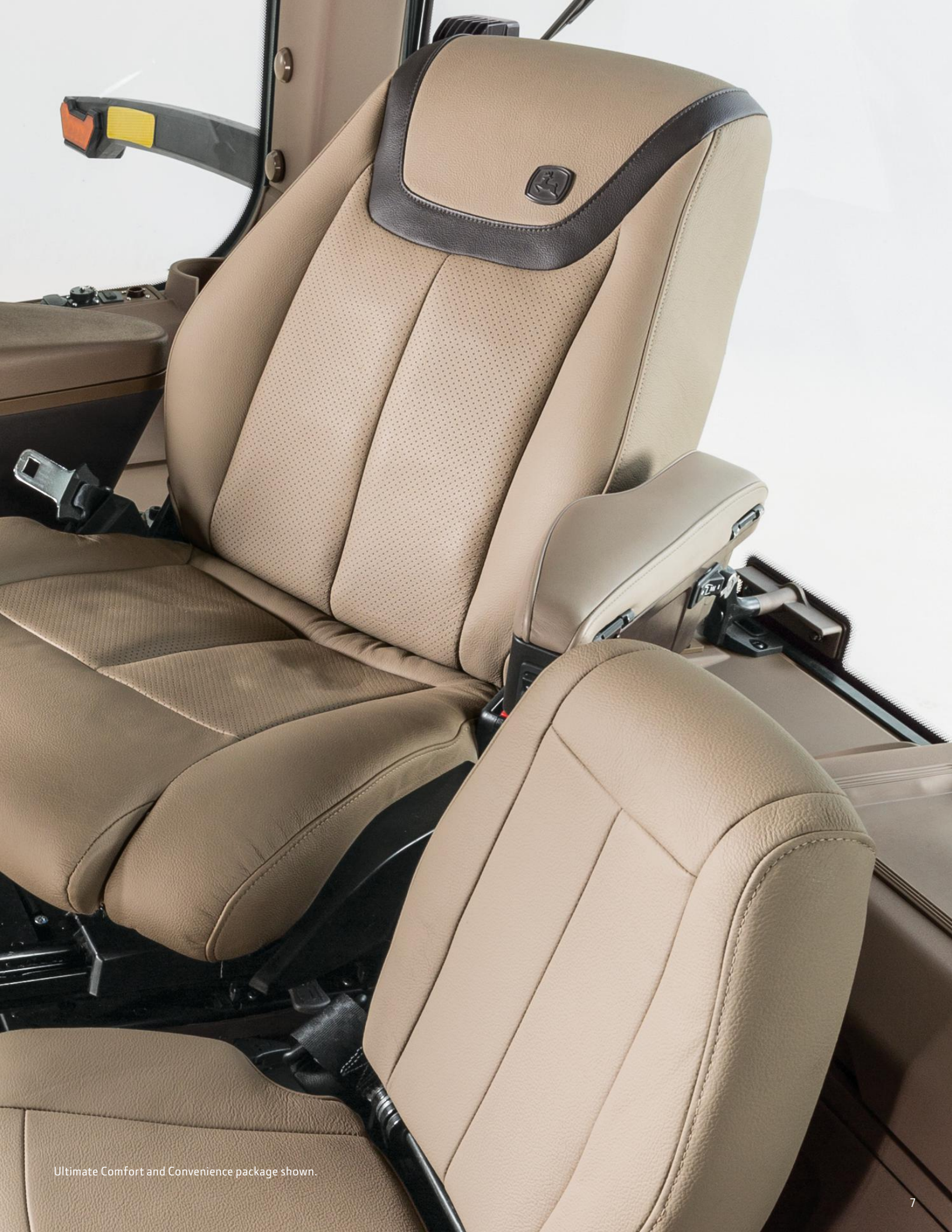
Ultimate Comfort and Convenience package shown.