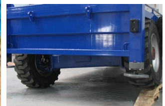
Automatic self-levelling outrigger system and oscillating axle