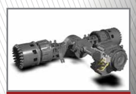
AxleTech drive axle