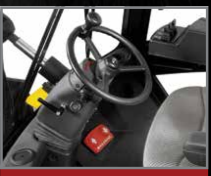
Fully adjustable steering column