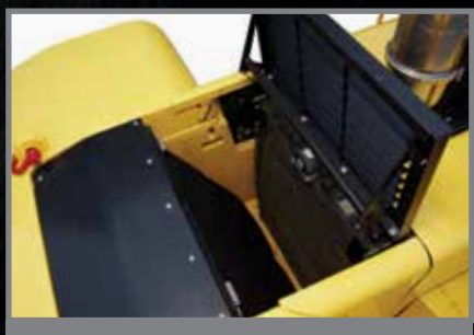
Hinged cover enables easy serviceability access to radiator cooler