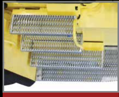
Broad, slip-resistant running boards