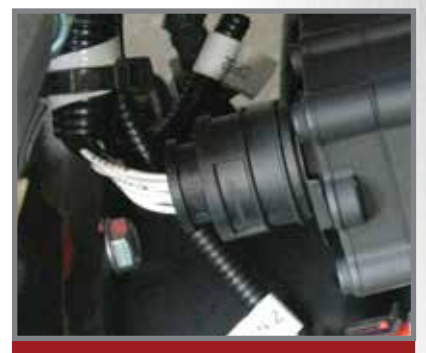
Standard profile Deutsch pin connectors, IP64 compliant