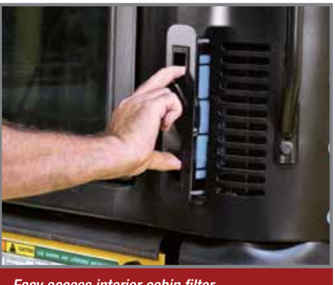
Easy access interior cabin filter

Hyster<sup>®</sup> trucks have been designed with the service technician in mind. Gull-wing hoods provide quick access to key components, and daily checks don't require tilting the cab. A tilting cab provides easy access to hydraulic components in seconds. Broad, slip-resistant running boards foster quick daily checks, while a large access bay enables easy radiator cleaning. A hydraulic sight gauge enables at-a-glance fluid level checks.