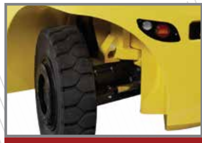
Heavy duty steer axle