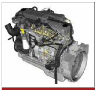
Cummins enabled powertrain

Hyster understands that your total cost of ownership extends beyond the initial acquisition costs. Hyster has teamed with leading quality suppliers to provide well-integrated systems that help reduce your overall cost of operations over the useful life of the truck.