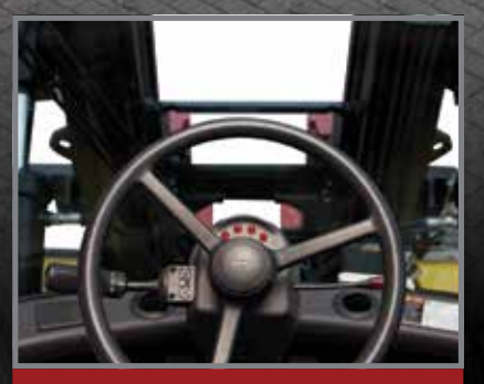
Optimized view of fork tips

Proportional settings enable smooth controllability of truck functions with unique settings to suit drivers' preferences. The automatic throttle-up function is enabled with a single touch actuation.