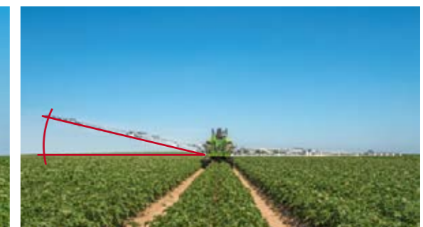
The ground contour or crop can be used as a reference for height control to precisely adjust the boom to suit your crop. A mixed control is also possible.