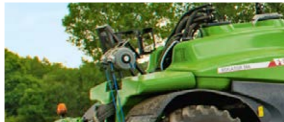
□ The practical hose reel at the rear of the sprayer allows quick, straightforward cleaning.