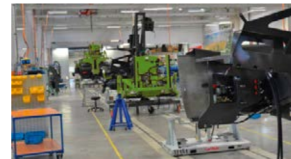
Our new high-tech production line for sprayer equipment at the Fendt Hohenmölsen site.