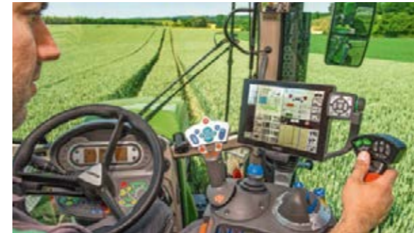
Optimal integration into the existing ISOBUS systems.