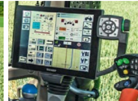
The Fendt Varioterminal gives you a perfect overview of your Rogator 300 with all relevant machine functions, SectionControl including coverage map, as well as other configurable functions.