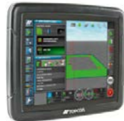
□ 10.4" display as a second terminal can be used for an even better overview.