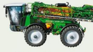
SX self-propelled sprayer, 4000 litres