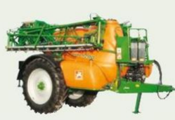
UX trailed sprayer, 3200/4200/5200/6200/11200 litres