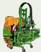
UF mounted sprayer, 900/1200 litres